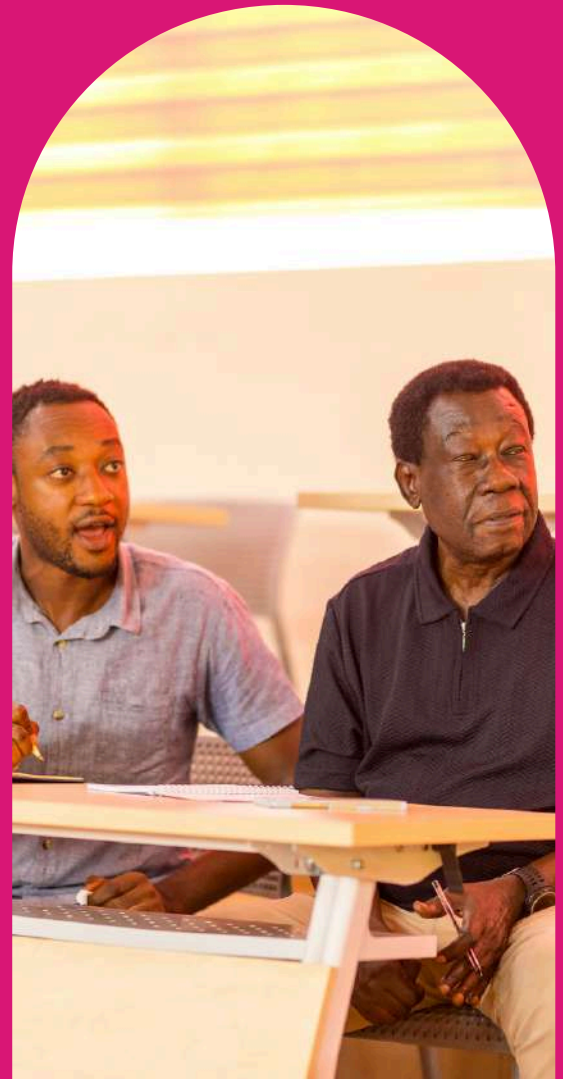
ACU Faculty Staff in one of our workshops

Overall, ACU was delighted with the insightful topics and engaging facilitation. For faculty and staff, the topics on blended learning and AI were timely as they embark on curricular reviews, meaning that they could implement their learning almost immediately. There was never a dull moment in the classrooms, which much laughter and discussion. Students felt more confident about finding employment and using videos and podcasts during their degree programme, with many being encouraged to start their own.