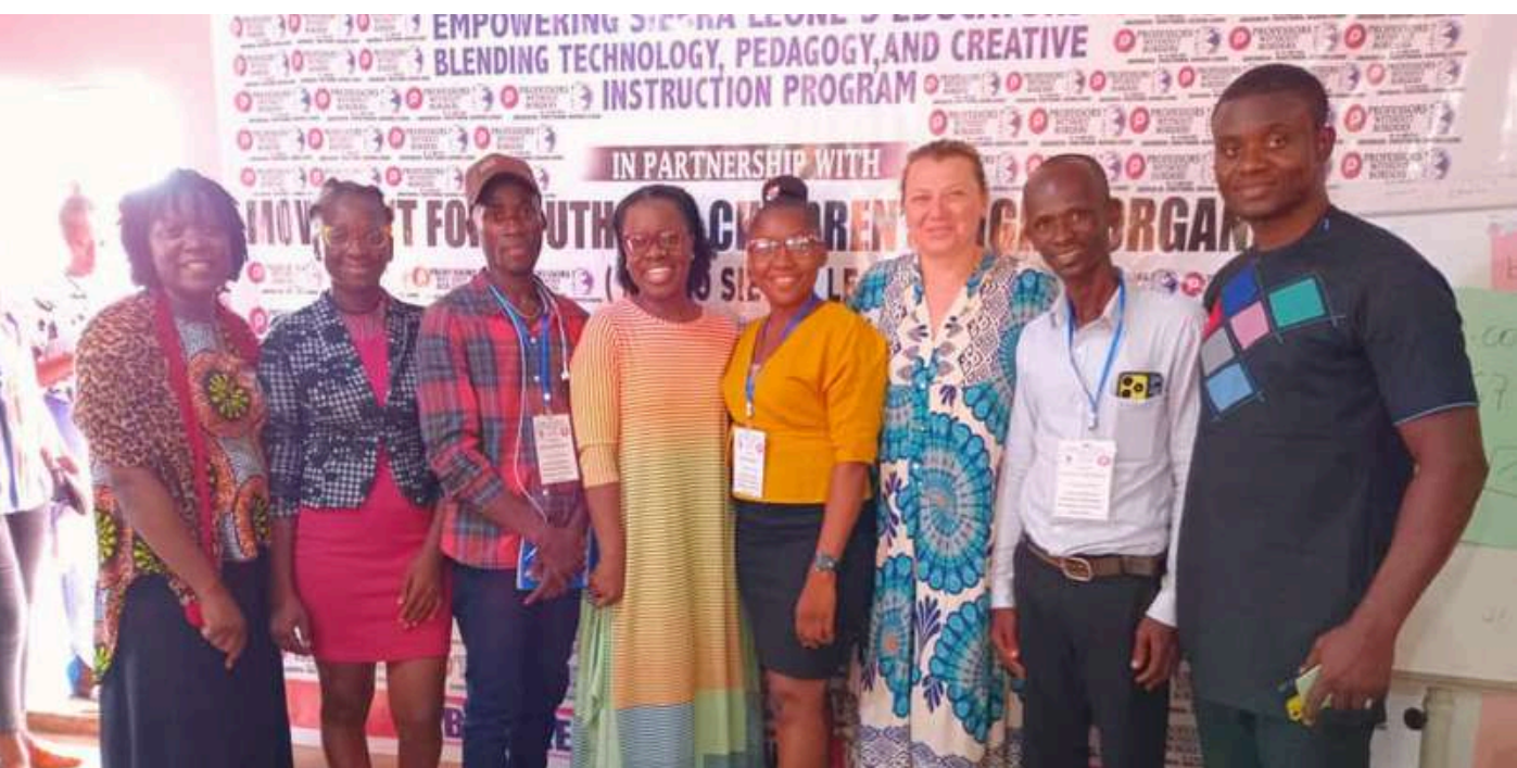
Professors Without Borders' volunteers with MYCRO's team.