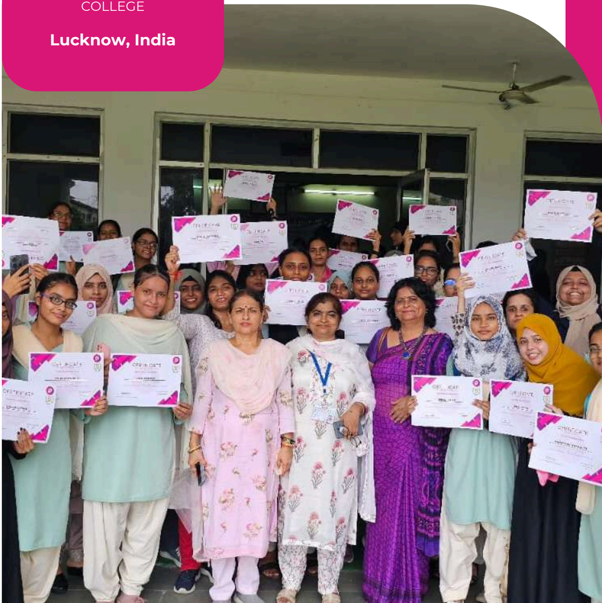
Students and faculty from Karamat Husain Girls P.G. College at certificate presentation ceremony.