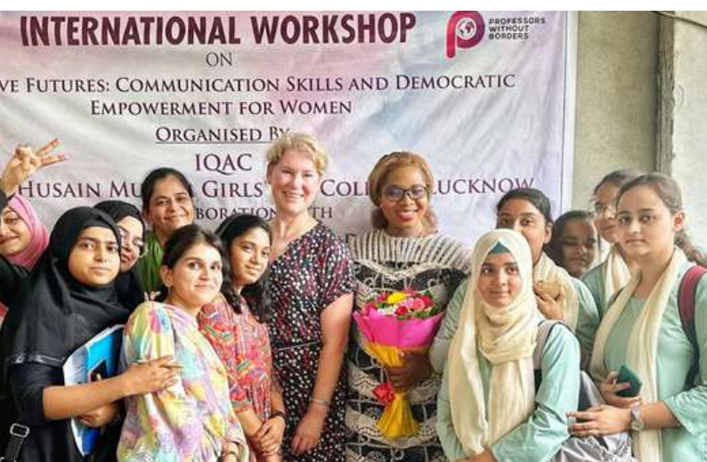
Our Volunteer Professors interacting with students on the first day of the programme.

This vibrant engagement not only reaffirms the power of cross-cultural collaboration but also ignites a beacon of hope for our future educational programmes. We look forward to the possibility of collaborating with Karamat Husain Muslim Girls P.G College again and hope to turn our one-day interaction with Mona-Convent school into a full-grown partnership.