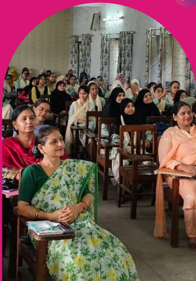
Students and faculty at the opening ceremony of the programme.

Our professors opened us to a potential new partner through their visit to The Mona Convent School where they delivered a one-day joint workshop for faculty on interactive teaching and communication workshop.