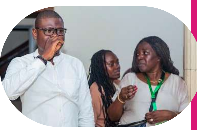
Student speaking during icebreaker activity