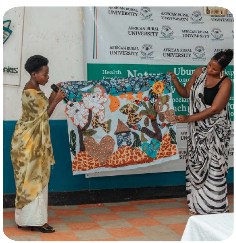
Student participants presenting their artwork made from recycled materials.

I have learned new classroom management tools like popcorn pass paper and jeopardy questions, among others. I feel motivated and inspired to be more efficient and teach more effectively than before.