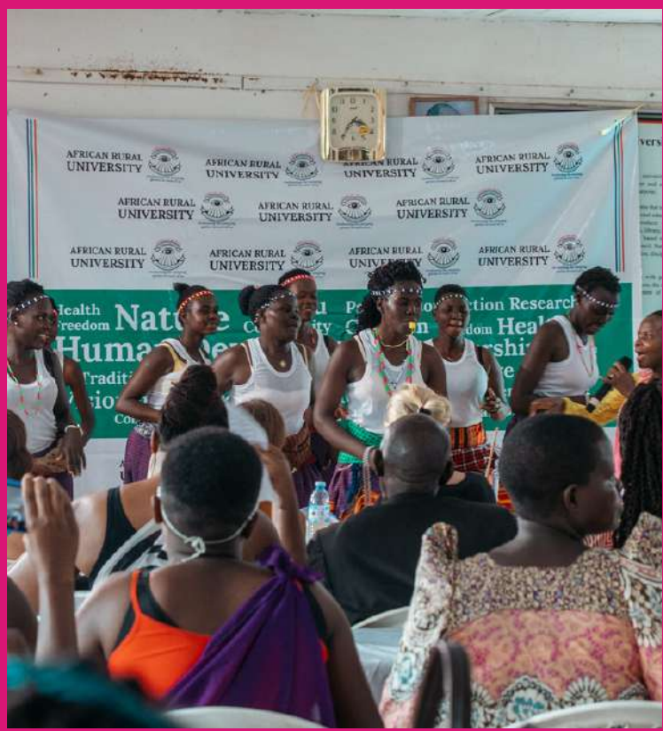
Cultural dance presentation by ARU students on the last day of the programme.

The enthusiasm of the participants and the support from the Kagadi community made this programme especially enriching and memorable.